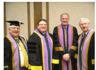
TENNESSEE FELLOW READY TO GO FOR THE CONVOCATION .

Hope you like what you see and read, and I hope we are able to get out the news for you to read and contemplate in your own quiet time.