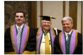
IT'S WEST VIRGINIA CELEBRATION TIME FOR THESE NEW FELLOWS.